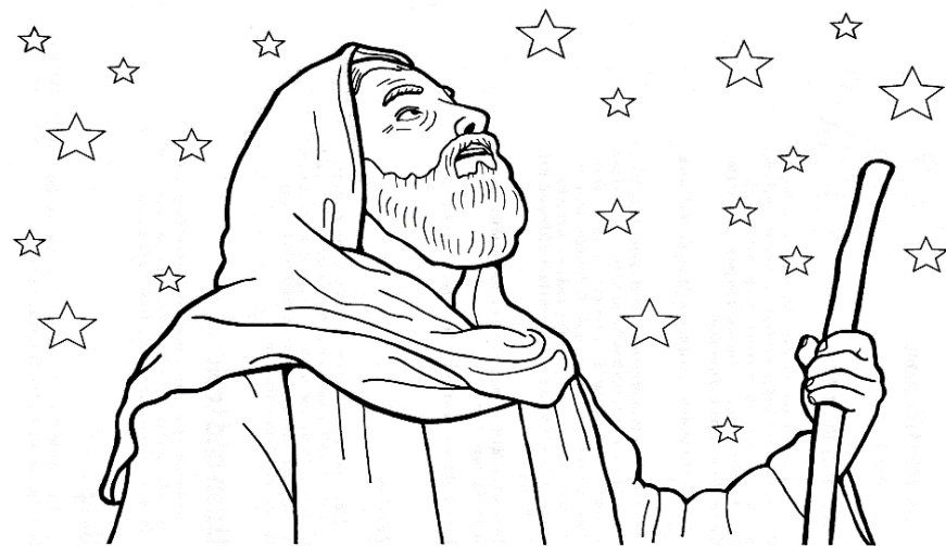
God called Abraham.

© 2017 www.nsfellowship.org All rights reserved. Do not photocopy for resale and reuse.